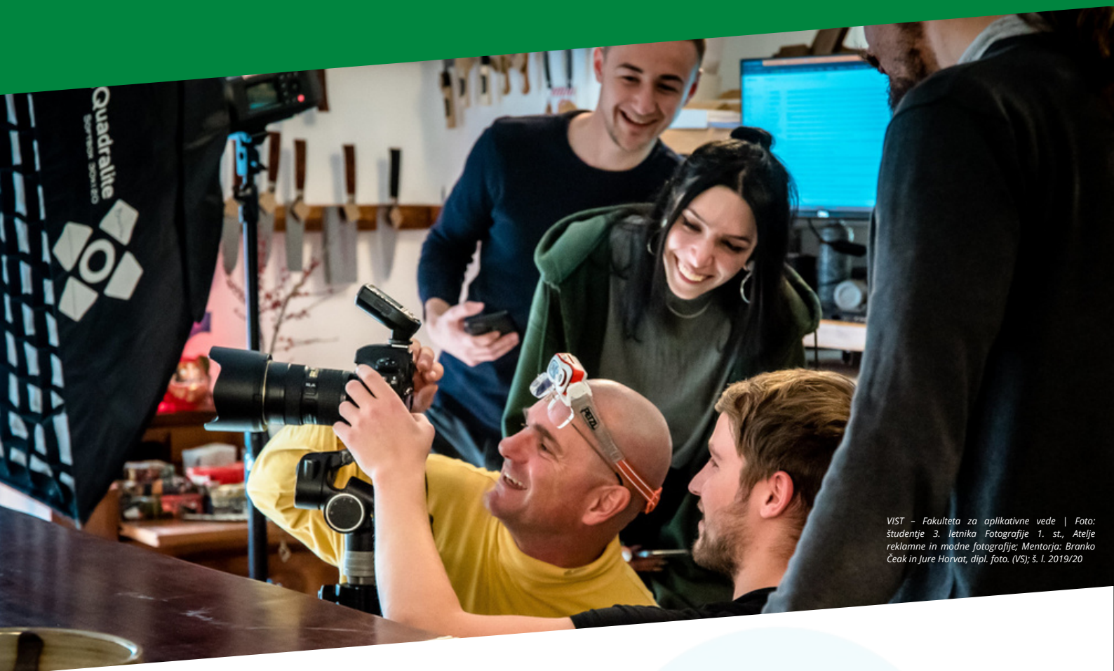
VIST – Fakulteta za aplikativne vede